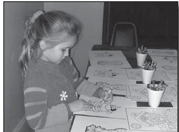
Kids colored Holiday pictures as West Walker residents met briefly before getting into Holiday festivities at the December meeting.