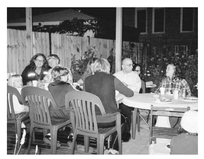
A Harvest Pot Luck was held in the Three Brothers Garden to celebrate the year's bountiful harvest.

to the pantry for distribution the next day. In addition to 20 raised growing beds, the garden features an ornamental gathering space and a pergola, providing a peaceful oasis on a busy stretch of Pulaski Road. All are welcome to enjoy the garden!