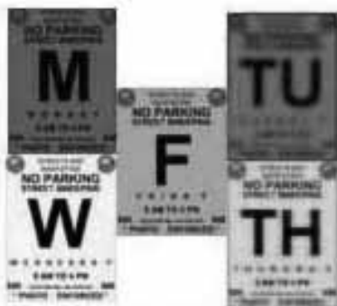
New No Parking Signs

Gone are the familiar orange temporary no parking signs to caution motorists not to park on that side of the street when street sweeping will take place. In their place are new temporary signs with a similar look but are instead color coded for the day of the week that sweeping will take place.