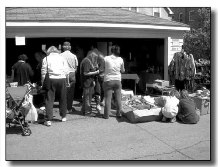
Garages and alleys were packed with bargain hunters for the WWCA Garage Sale