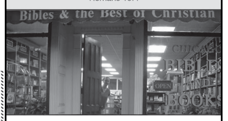
CHICAGO BIBLE & BOOKS

"That through the encouragement of the Scriptures we might have hope." Romans 15:4