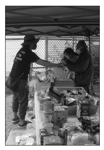
The Pantry's Take-One table.

The Pantry continues to give out a variety of personal-use items to its most in-need clients from the Take-One table in the delivery area, where clients can select items from a variety of options. Most in demand are toiletries of all types, which are difficult to keep in stock.