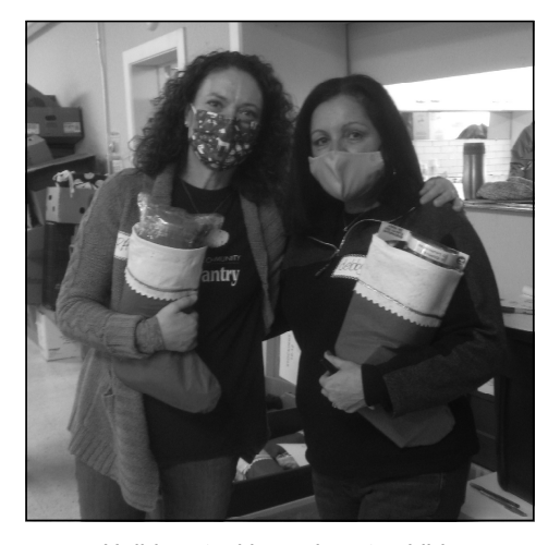
Holiday stockings given to children in December.

Thank you for all your support in helping us meet our mission of being "Neighbors Helping Neighbors!"