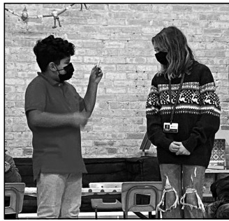
The annual Magic After-School Place (MAP) featured choreographed dancers and magic tricks!