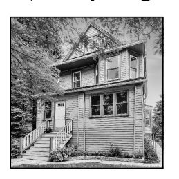
SOLD 4145 N Harding