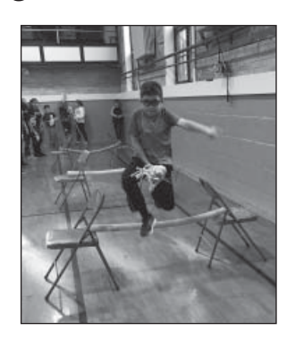
Hobbyhorsing at Carlson's after-school program.

The Magic After-School Place has a long-standing relationship with Schurz High School's buildOn mentoring program. That relationship was taken to a new level in midMarch when adult supporters of buildOn from Rodan & Fields visited MAP as part of buildOn's 36 Hours immersive experience. Approximately 30 people from across the US were visiting to "walk in the