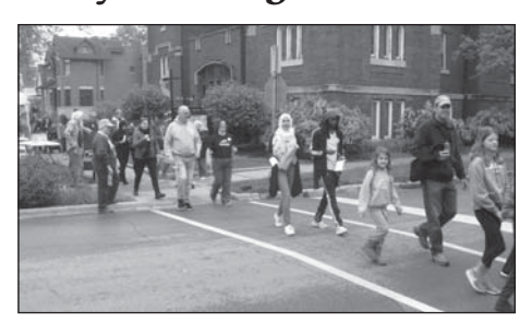
The Pantry will hold its second annual Neighborhood Walk on May 18th, at 9 am.

The Irving Park Community Food Pantry is organizing its second annual walk through the Old Irving Park neighborhood, in the vicinity of the Pantry.