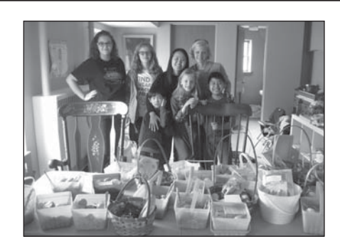
Volunteers are handing out Easter baskets to Pantry clients in April. If you would like to help with this program, contact Craig Shutt at craigshutt@ ameritech.net

(Please use plastic or fabric baskets that stack easily.) If you would like to help hand out