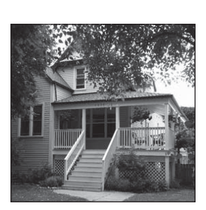
4239 N. Ridgeway