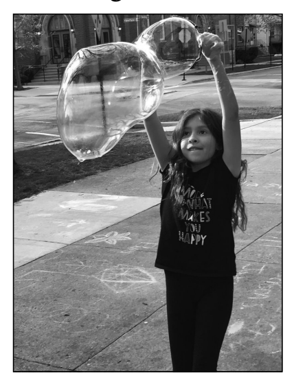
Registration for MAP Summer Camp is open now. Visit carlsoncommunityservices.org/events/ for information about this fun and engaging four-week camp.

cost of camp is $160 per week and campers must attend all four weeks. Tuition assistance is available. If you are worried your child has missed out on important socialization opportunities, MAP Summer Camp will provide engaging, COVID-compliant opportunities for your child to build friendships and create memories to last a lifetime! To learn more and to register, visit