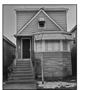
SOLD 4309 N BERNARD