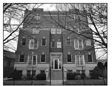
SOLD 4232 N HARDING 1N