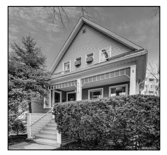
SOLD 4019 N RIDGEWAY