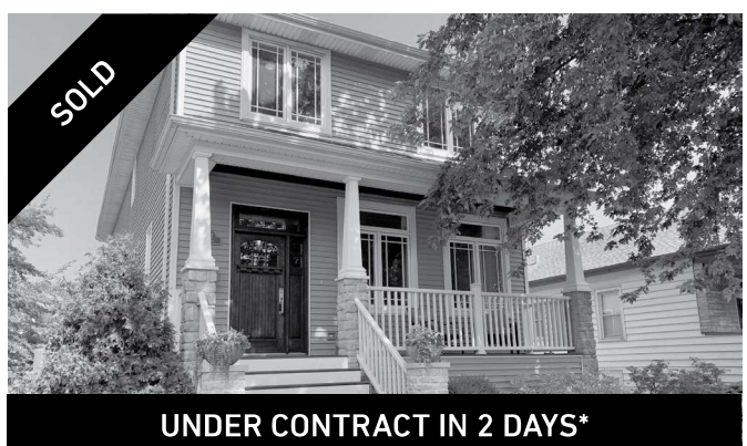
4427 N. Kilbourn 52' x 156' lot • 5 bed/3.1 bath