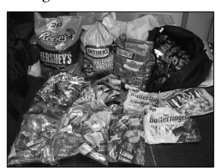
The Irving Park Food Pantry is seeking donations of Halloween candy to provide to its clients' children (up to 13 years old) during October in advance of the holiday.

The Irving Park Food Pantry hopes to make trick-ortreating a little more fun for its clients' children this year