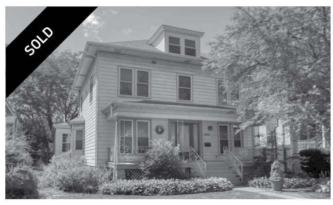
3832 N. Keeler 50' x 156' lot • 4 bed/2.1 bath