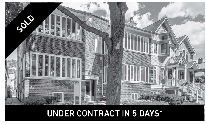
4041 N. Kilbourn Duplex • 3 bed/2.1 bath