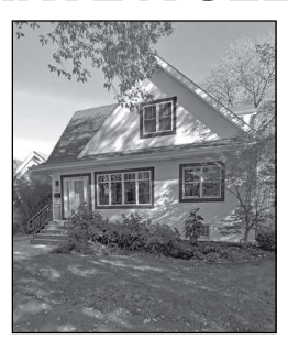
SOLD 4127 N LAWLER