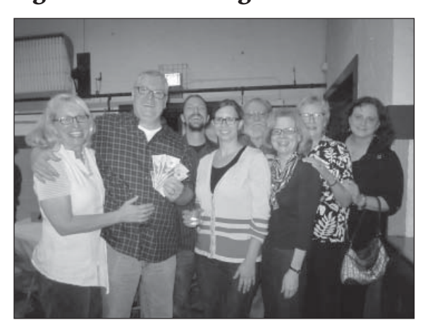
Top: The Gipsters pose with their $150 prize money. The Trivia Night champs generously donated $100 back to Carlson Community Services.

Thanks to the 18 teams that came out for a fun and competitive Trivia Night on October 11th. Proceeds benefited Carlson Community Services programs. Carlson helps at-risk kids succeed with The Magic After-School Place (MAP), reduces hunger and beautifies our neighborhood with Three Brothers Community Garden and makes fine arts affordable and accessible through the Irving Park Fine Arts Concert Series.