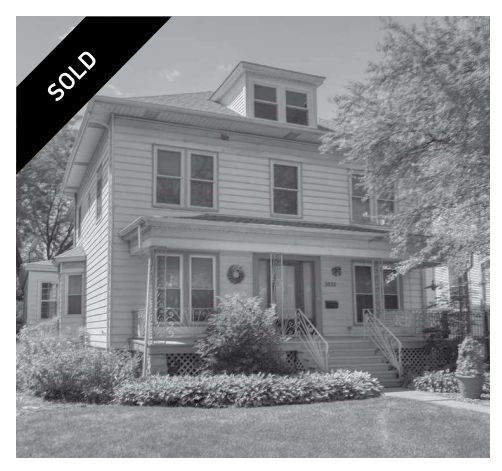
3832 N. Keeler 50' x 156' lot • 4 bed/2.1 bath