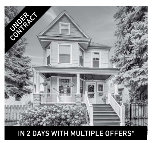
4138 N. Harding 3 bed/2.1 bath