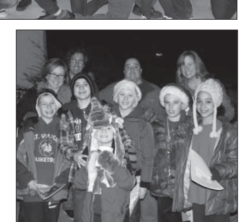
Young people from all over the neighborhood shared their voices in caroling to raise funds for Hands to Help Ministries!

A special thanks to the many volunteers: Build On teens from Schurz High School, Brownies from St. Edward's, teens and adults from St. Viator's, familes and adults from St. John's and United Methodist, and many others from the Old Irving Park community. Thanks to the generosity of our community, over $1300 was collected!