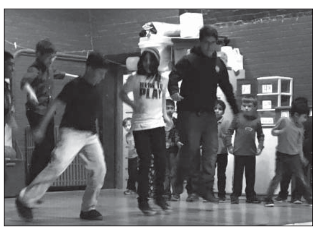
MAP kids break out their dance moves for the Third Annual Talent Show.

773-844-4580 barry@bebartarchitecture.com