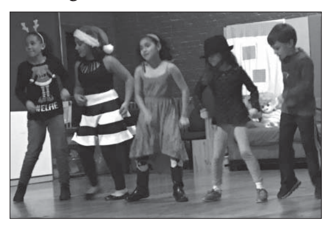
It's the Whip and Nae Nae at the MAP Talent Show!

The Magic After-School Place (MAP) held its third annual talent show on December 18th. The acts included comedy (knock-knock jokes), magic tricks, singing and dancing. Family members and friends were amazed at the MAP kids' talents!