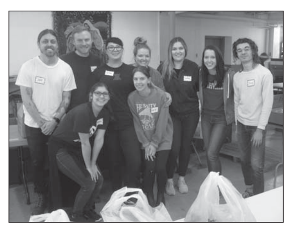
Volunteers from VSA Partners worked a variety of stations during their visit to the Pantry in December.

We appreciate everyone in the West Walker neighborhood who supports our efforts and helps us to meet our mission of being "Neighbors Helping Neighbors."