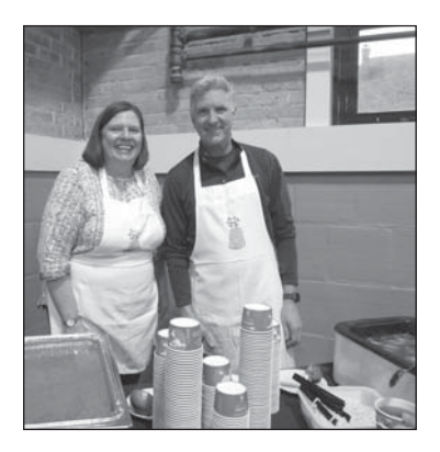
Carlson's annual Soup & Bread fundraiser will be held on Sunday, February 10th.

The Irving Park Fine Arts Committee and the Magic After-School Place are programs of Carlson Community Services, a 501c3 non-profit. Its mission is to connect the Irving Park community with programs that enrich lives through culture, education and service. To learn more, visit carlsoncommunityservices.org.