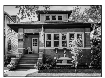
SOLD 4124 N SPRINGFIELD