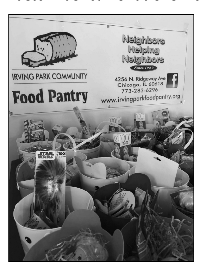
The Pantry is collecting donations for its annual Easter basket program for clients' children up to 8 years old. Items and assembled baskets are welcome.

The Pantry will give out Easter baskets to clients' children up to 8 years old from March 3rd to 31st (prior to Easter on April 4th). We are looking for donations of dollar-store Easter baskets, plastic eggs (empty or filled), small wrapped candies, small toys and plush animals.