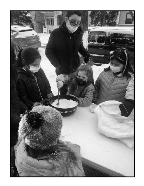
Making snow cream at the Magic After-School Place (MAP).

The Magic After-School Place (MAP) is in its 15th year of providing high quality, affordable after-school care for children attending Murphy and Belding Schools. We welcomed students back to MAP this past fall for inperson programming and have a few additional spaces available. With a fully vaccinated staff, strict attention to masking and distancing, and additional cleaning