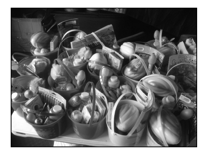
The Pantry is collecting items for Easter baskets to be given out to clients' children in March and April.

small plush animals, party-favor-sized toys and wrapped candies. Please do not donate Easter baskets, we are looking only for items for the baskets.