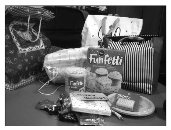
Birthday kits consisting of cake mix, frosting, candles, little candies, and paper plates and napkins were donated to the Pantry by the Girl Scout Troop at Sts. Viator & Wenceslaus Church.