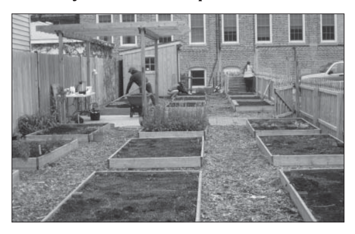
The first work day in Carlson's Three Brothers Garden will be April 13th from 9:00 to 11:00 a.m.

Three Brothers Garden will start the 2013 volunteer growing season with a general clean up, bed soil topping off, and lettuce and pea planting on April 13 from 9:00 to 11:00 a.m. Come one, come all!