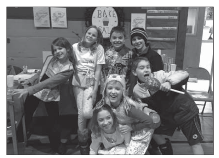
Even the neighborhood kids got in the game, volunteering to sell drinks and bake sale goodies.

Here are some highlights from Soup & Bread for Carlson held March 1st.