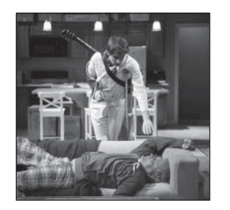
A scene from End Days.