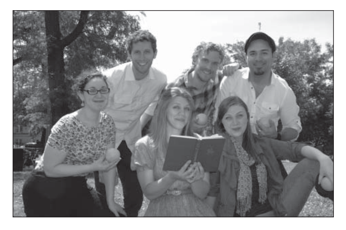
Filament players, actors and directors will create and perform for Sustain-36 on April 19.

The weekend also features Sustain 36 , a zero-waste, 36-hour community-supported play festival. Thirtysix hours from showtime a title will be selected (from community submissions) and a group of actors, directors and playwrights will collaboratively create an entirely new play. All props, services, or support needed to create the show will be requested from community members via social media. Then, at 8 p.m. on Sunday, April 19th, Filament will perform this brand new show. It's like a potluck for playmaking! Follow Filament on Facebook and Twitter using #sustain36 starting at 8 a.m. on April 18th to take part in this community-supported project. Any community member who has loaned an item or participated in the creation of the project can attend the show for free (tickets can also be purchased for $20)!