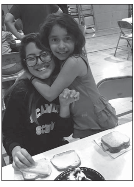
The Magic After-School Place held its first Spring Break camp in April. 28 students participated. All had fun!