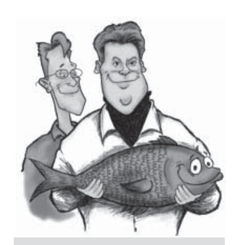
Bring this ad, and we will offer half-price Afishionado Club membership!

Conveniently located near Elston and Montrose Avenues. On-Street Parking and customer front-loading zone available.