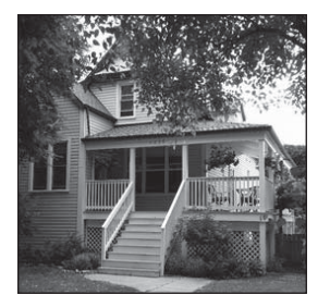
4239 N. Ridgeway