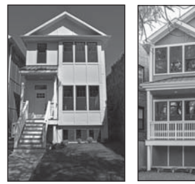
ALL SOLD - 4015 & 4017 N. Harding