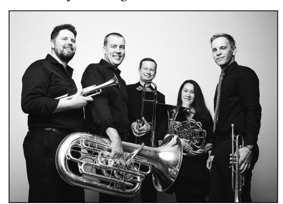
Gaudete Brass will perform in a free concert sponsored by Carlson Community Services on December 12th at 2:00 pm at Irving Park Lutheran Church.

Through late October, we've donated over 450 lbs. of vegetables to the Food Pantry. Thanks to generous neighbors, our donations were bolstered by home garden surplus, which we gladly took to the Food Pantry Wednesday mornings.