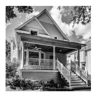
UNDER CONTRACT 4110 N Avers