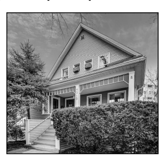
SOLD 4019 N Ridgeway

YES! Home prices are up 11% and the number of homes for sale is down 7%. It's still a sellers' market.