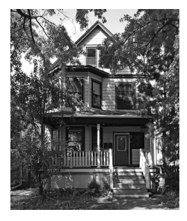
UNDER CONTRACT 4240 N Monticello

Homes in our neighborhood are selling fast. And as Your Realtor, I want you to get the top sales price.