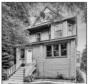
SOLD 4145 N Harding