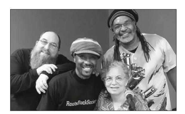
Roots Rock Society will perform at IPUMC on December 18

Soup & Prayer on Mondays at 11:30 am. Everyone is welcome to this brief space providing time to pause to remember the sacred in the midst of this busy season of advent. Prayer begins at 11:30, followed by a simple lunch of soup and bread. The last Soup & Prayer is December 19.